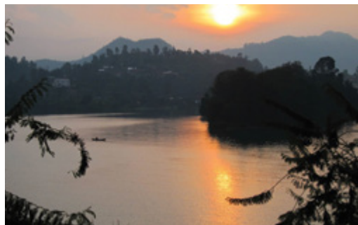
Sunrise over Lake Kivu, Bethany Hotel, Kibuye Rwanda

The Rwanda course is focused on water and energy issues associated with Lake Kivu, one the Great Lakes of Africa and extant analogue of a "shale basin" in an active rift system. Lake Kivu's unique water column stratification is a source of methane for the Rwandan power grid ( www.lake-kivu.org/monitoring_programme ), and a colossal natural hazard to the riparian population, due to the extraordinarily high concentrations of carbon dioxide dissolved in its deep waters. The class will consist of on-site lectures and practical exercises in the fields of limnology, limnogeology, tectonics, aqueous chemistry, and energy.